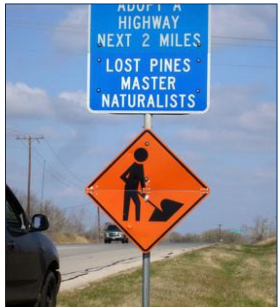
Lost Pines Master Naturalists adopt 2 miles of Highway 95 north of Bastrop

I look forward to seeing you at our March 17th meeting at the Red Rock Community Center. Come and learn about land trusts and conservation easements from our friends with Pines and Prairies Land Trust.